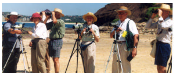
Bird monitoring -Long Reef Point

Wader birds: www.environment.gov.au/water/wetlands/shorebirds.htm