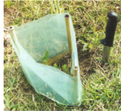
Folded guard & half stakes