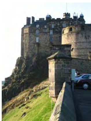
A view of Edinburgh Castle