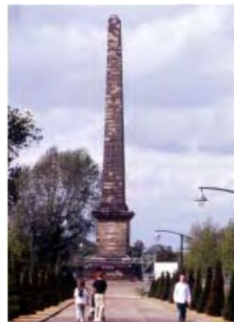
Monument - Glasgow Green

Novice Juvenile Final - Selection in Quick March Rhythm Grade 4 Final - Selection in Quick March Rhythm Juvenile - MSR; Grade 3 - Medley Grade 2 - MSR (submit 2); Grade 1 - Medley (submit 2)